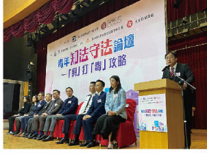
Activities Organised for Young People