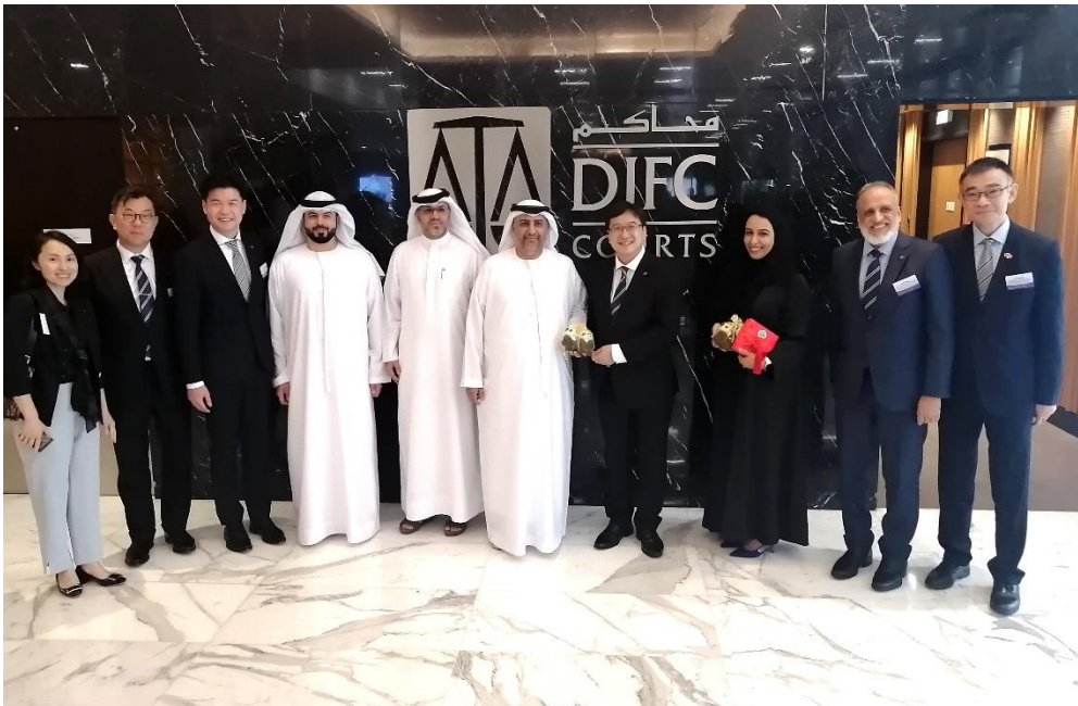
Photo shows representatives of The Law Society of Hong Kong and the DIFC Courts.