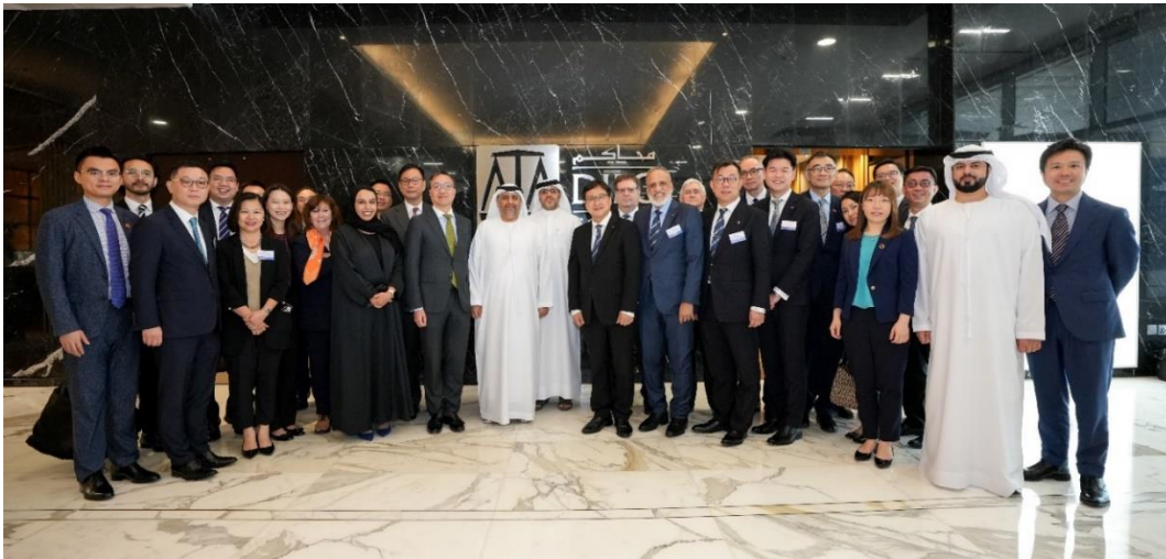
Photo shows the Hong Kong legal and business delegation and representatives of the DIFC Courts.