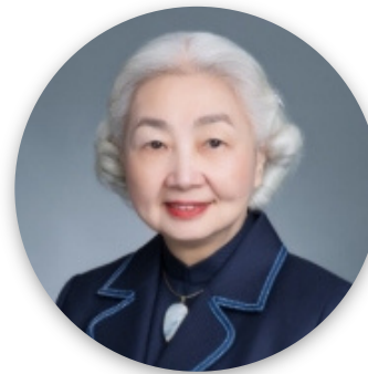
Dr the Honourable Elsie Leung Oi-sie, GBM, JP

The First Female Chief Justice of Malaysia (2019–2025)