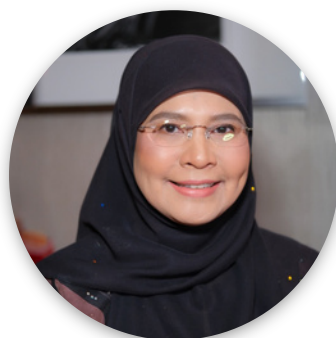
The Right Honourable Tun Tengku Maimun binti Tuan Mat

The First Female Chief Justice of Malaysia (2019–2025)