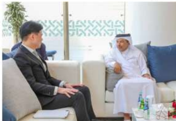
رئيس محكمة الاستثمار والتجارة يجتمع مع وفد من جمعية القانون في هونغ كونغ