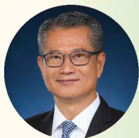
The Hon CHAN Mo-po Paul Financial Secretary The Government of the HKSAR