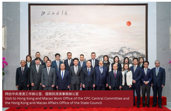
拜訪中央港澳工作辦公室、國務院港澳事務辦公室 Visit to Hong Kong and Macao Work Office of the CPC Central Committee and the Hong Kong and Macao Affairs Office of the State Council