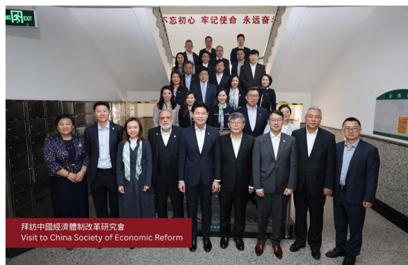
拜訪中國經濟體制改革研究會 Visit to China Society of Economic Reform