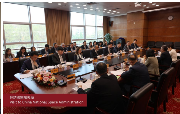
拜訪國家航天局 Visit to China National Space Administration