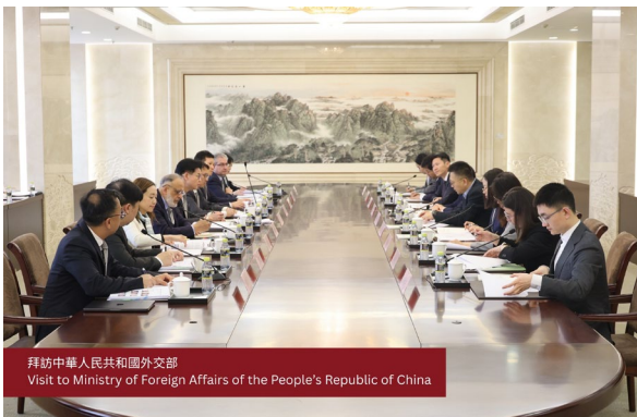
拜訪中華人民共和國外交部 Visit to Ministry of Foreign Affairs of the People's Republic of China