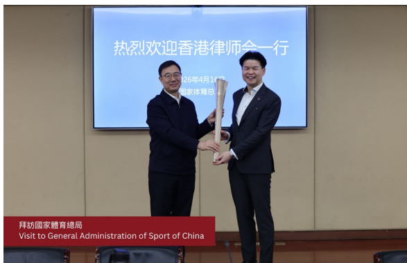
拜訪國家體育總局 Visit to General Administration of Sport of China

Another new organisation the Council visited was the China Society of Economic Reform. Our exchanges covered emerging areas such as the development of the digital Renminbi, where Hong Kong, by leveraging its institutional strengths, solid rule of law foundation and internationalised professional services, could serve as an important anchor for institutional connectivity, international outreach and risk governance, thereby offering stronger support to the country's overall development.