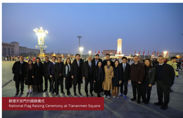
觀禮天安門升旗儀式 National Flag Raising Ceremony at Tiananmen Square

I would also like to share a lighter yet deeply memorable anecdote. 15 April 2026 marked the National Security Education Day. As Council members and I made our way to the Tiananmen Square in the very early morning to witness the National Flag-Raising Ceremony, we unexpectedly encountered more than 200 primary school students from Hong Kong. Two generations came together by chance at one of the capital's most significant landmarks, jointly witnessing this solemn moment, which we felt deeply honoured to share together. The delegation was delighted to take commemorative photographs with the students, capturing an occasion of special significance. That moment left us with a profound sense of the younger generation's concern for, and connection with, the country and the society – an experience that was not only one of witnessing history, but also of its transmission.