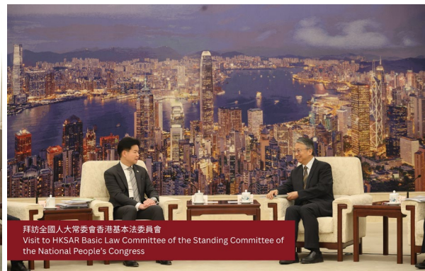
拜訪全國人大常委會香港基本法委員會 Visit to HKSAR Basic Law Committee of the Standing Committee of the National People's Congress