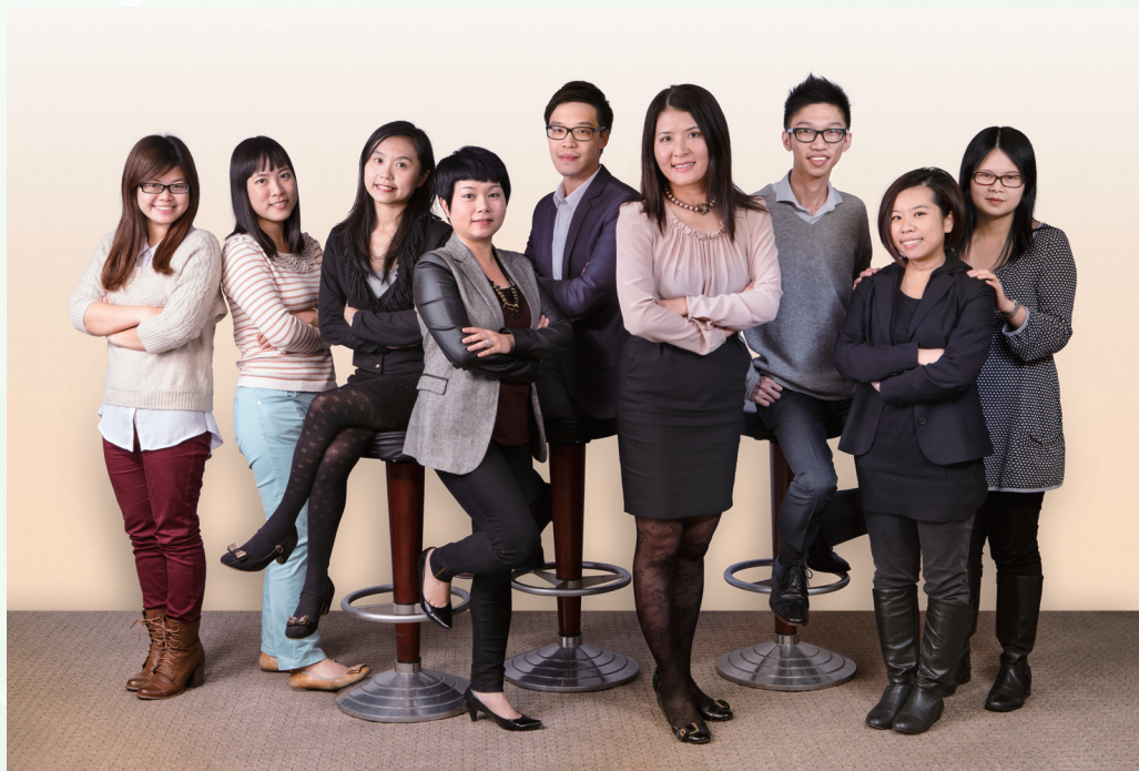
Member Services Department

Secretary: Assistant Director, Member Services