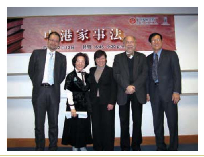
Course on Family Law