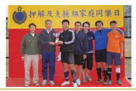
Escort and Support Group Annual Family Day Soccer Match