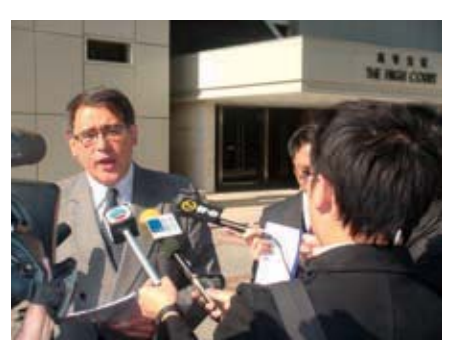
On the spot interview on human rights issues

Press conferences and press releases promoting various projects and special events initiated by The Law Society were organized during the year. Daily news alerts were also prepared to keep Council Members abreast with news concerning the Law Society and the legal profession including public policies that might have an impact on the legal profession.