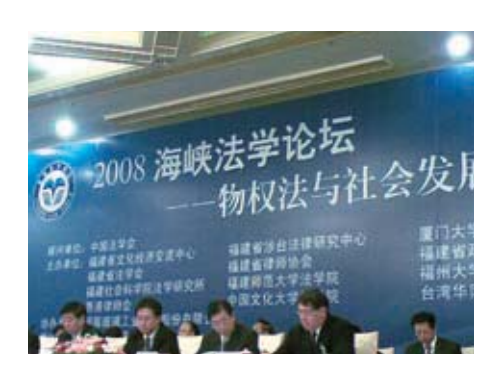
Fuzhou Straits Law Forum