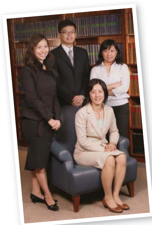
Department of External Affairs