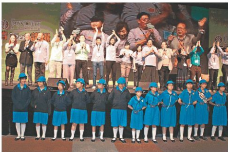
Teen Talk: the largest ever forum for Hong Kong teenagers organised by an enthusiastic group of socially conscious solicitors